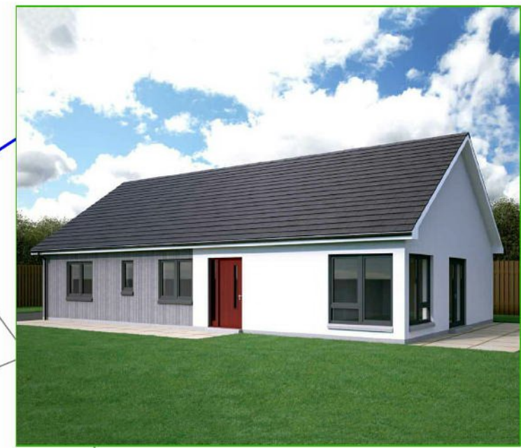
INDICATIVE HOUSE TYPE

subject to the requirements of the associated Decision Notice